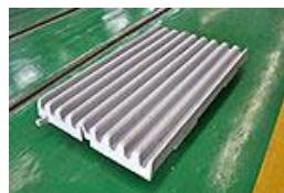
Movable jaw plate