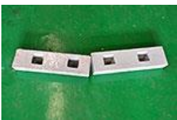
Weights for movable