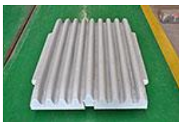
Fixed jaw plate