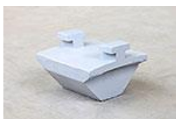
Circum Guard plate